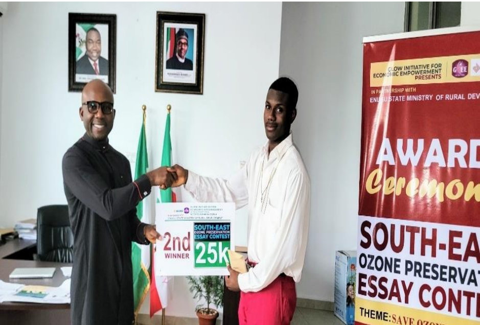
2 nd Prize winner receiving his cash award