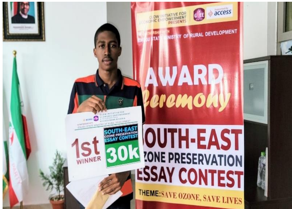
The winner of the essay contest poses for photograph