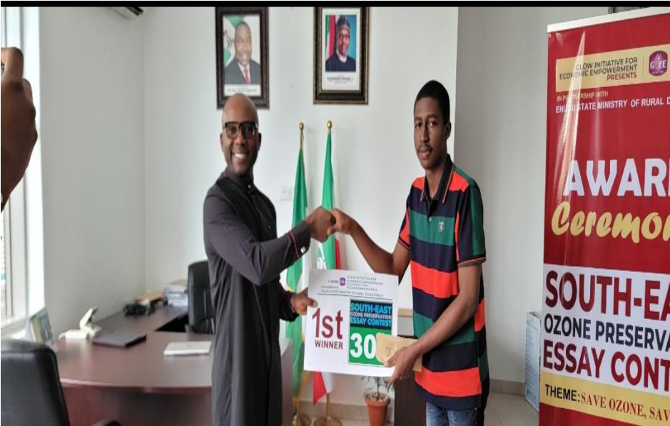
1 ST Prize winner receiving his cash award