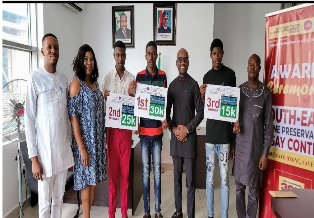
The program lead, Ozone Action Program (left), the P.R. O Michael Okpara University, the 2 nd Prize winner, the 1 st Prize winner, the Commissioner, the 3 rd Prize winner and a guest pose for photograph