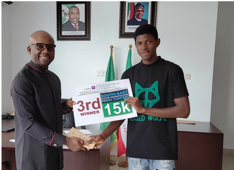
3 rd Prize winner receiving his cash award