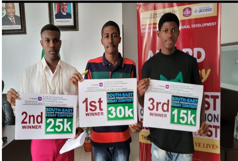
The Top 3 Finalists pose for a photograph